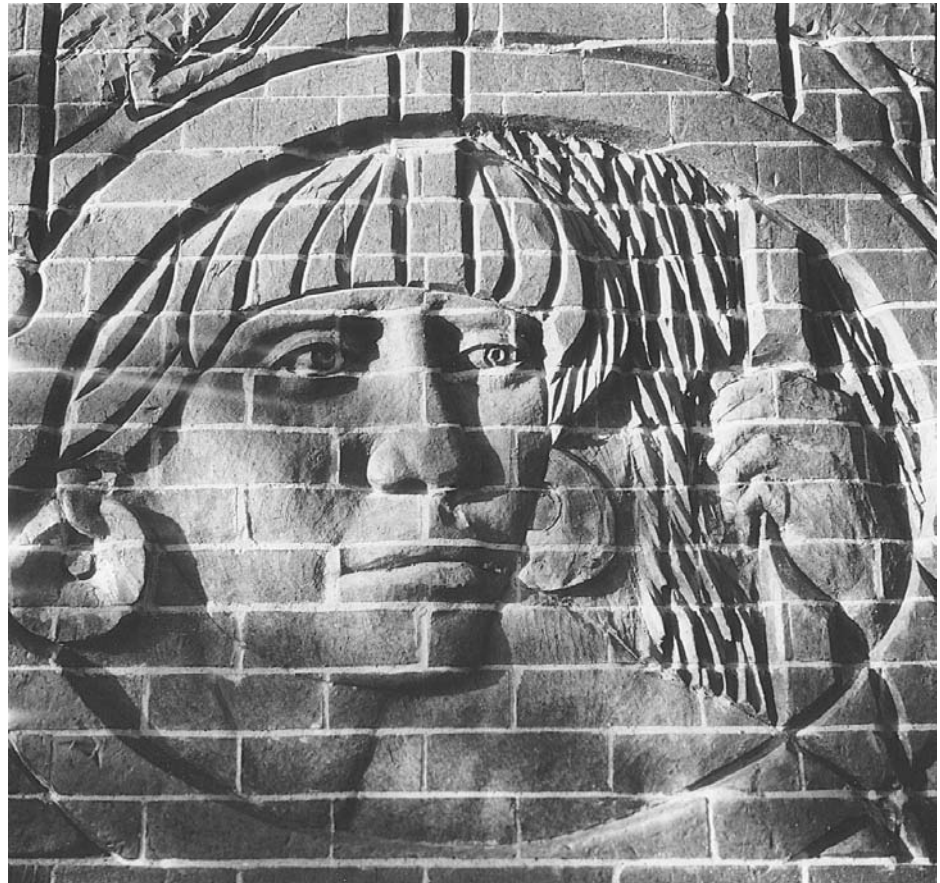
Figure 3-9 Sculptured brick is carved by the artist before the brick is fired.

One of the traditional distinctions made between different clay masonry products is based on the definition of brick as “solid” (core area of less than 25%) and clay tile as “hollow” (more than 25% cored area). However, during the 1970s, new standards were developed for “hollow brick” with a greater core area than that previously permitted for brick, but less than that allowed for tile.